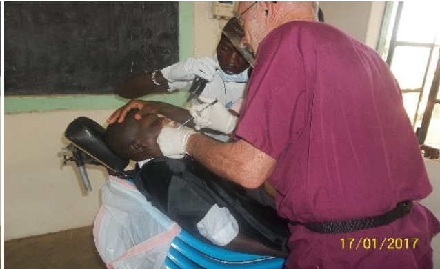
Jesus's Hands and Feet