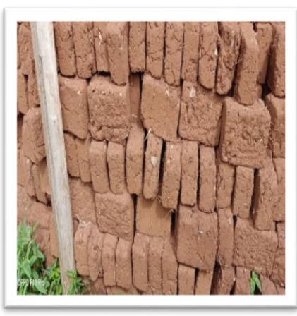
Drying bricks, ready to be baked.