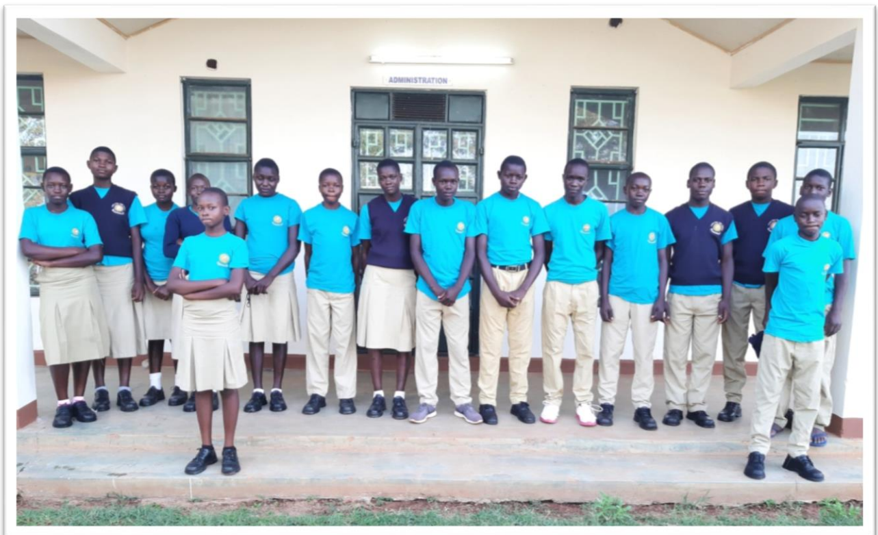
Students Needing Sponsoring

P.S Check out our webpage at livinghopehighschool.org and our monthly newsletter to find out what is going on at the school and the students that need sponsoring.